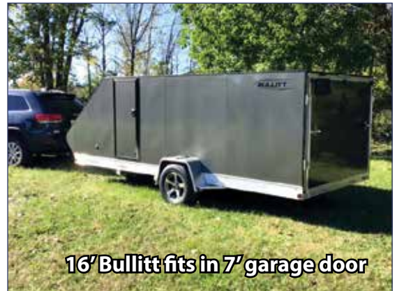
16' Bullitt fits in 7' garage door