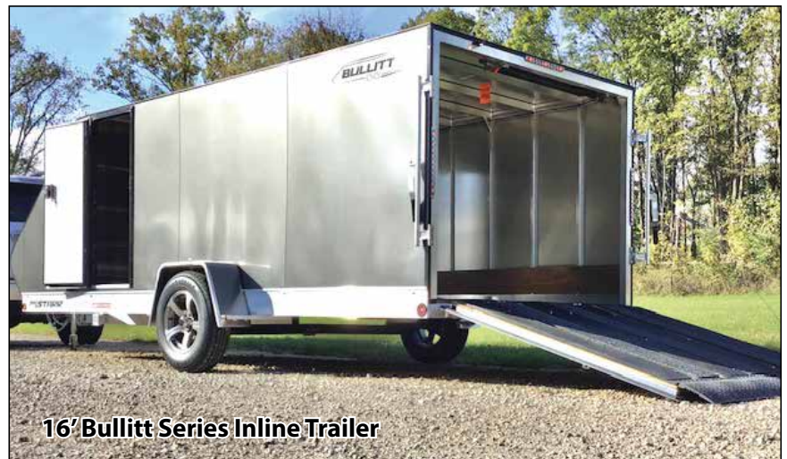
16' Bullitt Series Inline Trailer