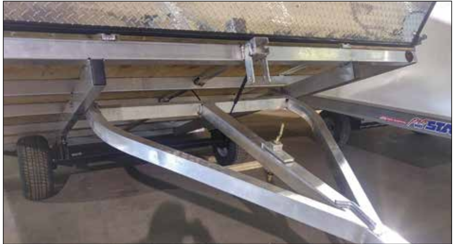
STD wishbone tongue with anti rattle and pin locks