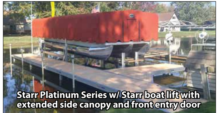
Starr Platinum Series w/ Starr boat lift with extended side canopy and front entry door