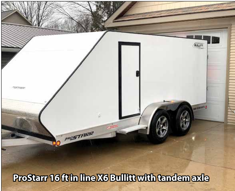
ProStarr 16 ft in line X6 Bullitt with tandem axle

The Most Aerodynamic & Easiest Towing Trailers in the Industry