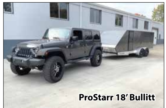
ProStarr 18' Bullitt