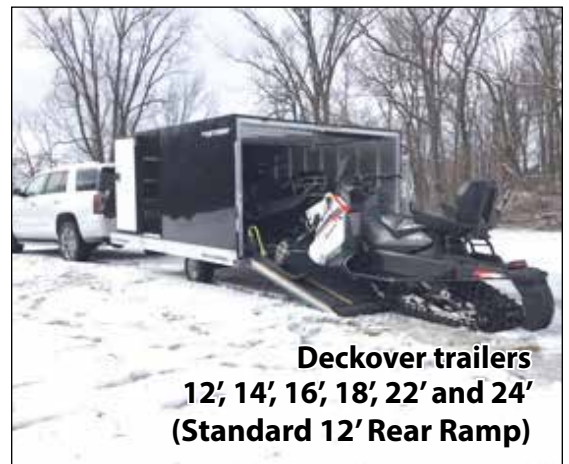
Deckover trailers 12', 14', 16', 18', 22' and 24' (Standard 12' Rear Ramp)