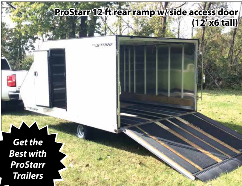
ProStarr 12-ft rear ramp w/ side access door (12' x6 tall)