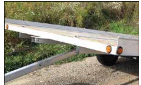
Heavy Duty tongue with guide improves turning radius

ProStarr Trailers come standard with either our Heavy Duty tongue with guide/housing, or you can choose our New Wishbone tongue. Either tongue choice is designed to be the strongest in the industry.