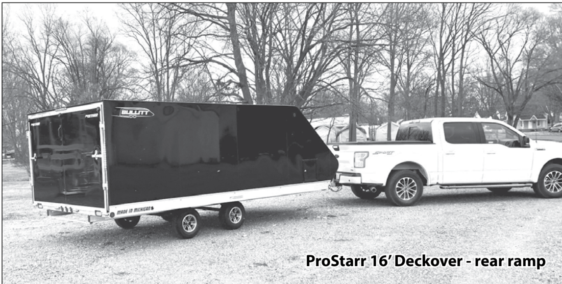
ProStarr 16' Deckover - rear ramp

From our family to your family... Hope to see you on the trails!