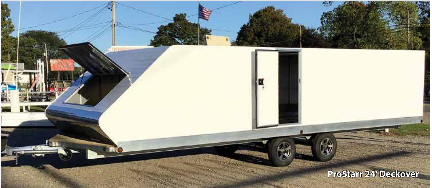
ProStarr 24' Deckover