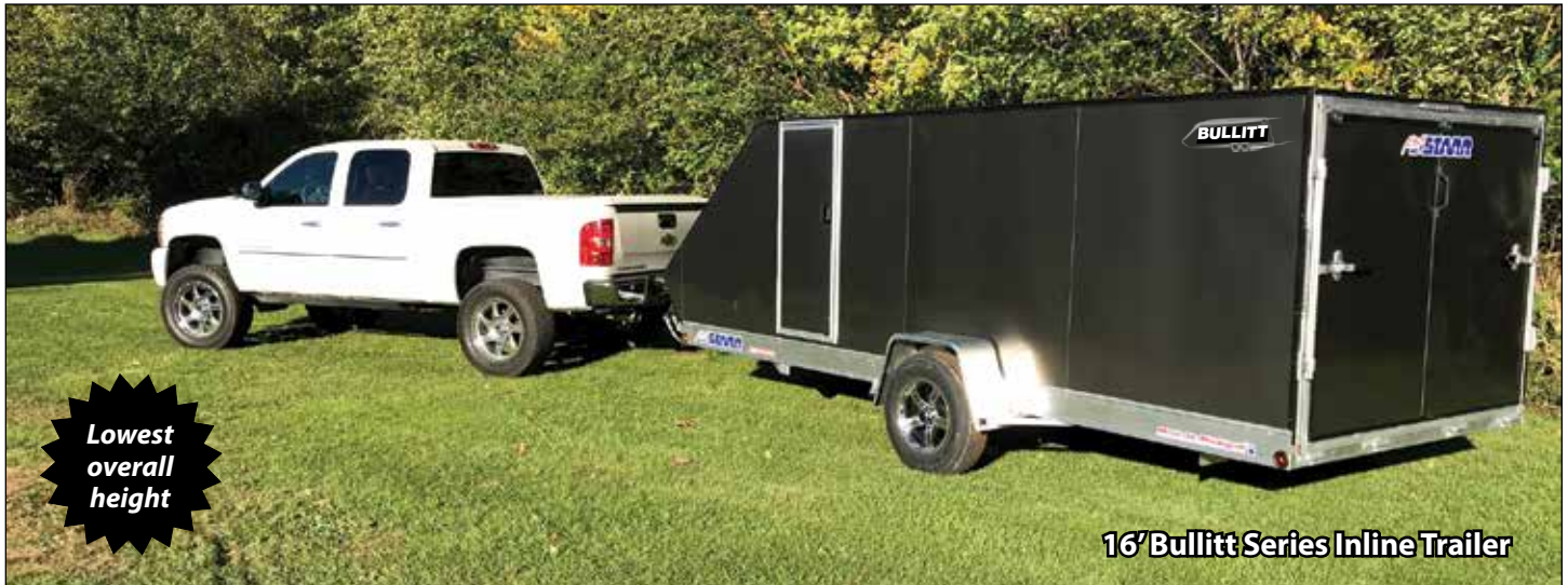
16' Bullitt Series Inline Trailer

The Bullitt was made for the die-hard snowmobiler that sets out in the middle of a snow storm to their favorite trail. The heavy-duty axle mounts, the large 6-1/2" side rails, and 15" tires make this aerodynamically designed trailer perfect for hauling in the winter months.