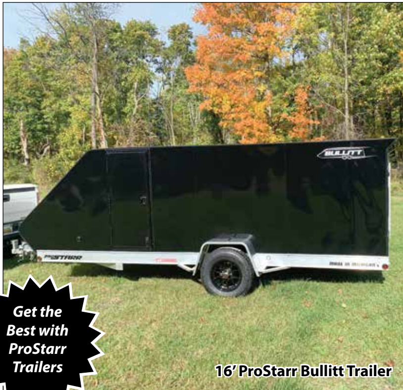
16' ProStarr Bullitt Trailer