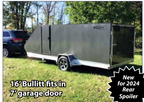
16' Bullitt fits in 7' garage door