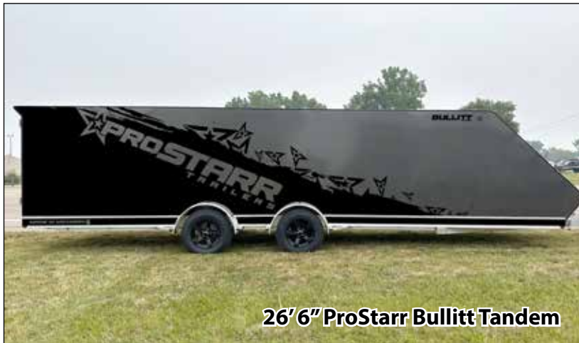
26'6" ProStarr Bullitt Tandem

The Most Aerodynamic & Easiest Towing Trailers in the Industry