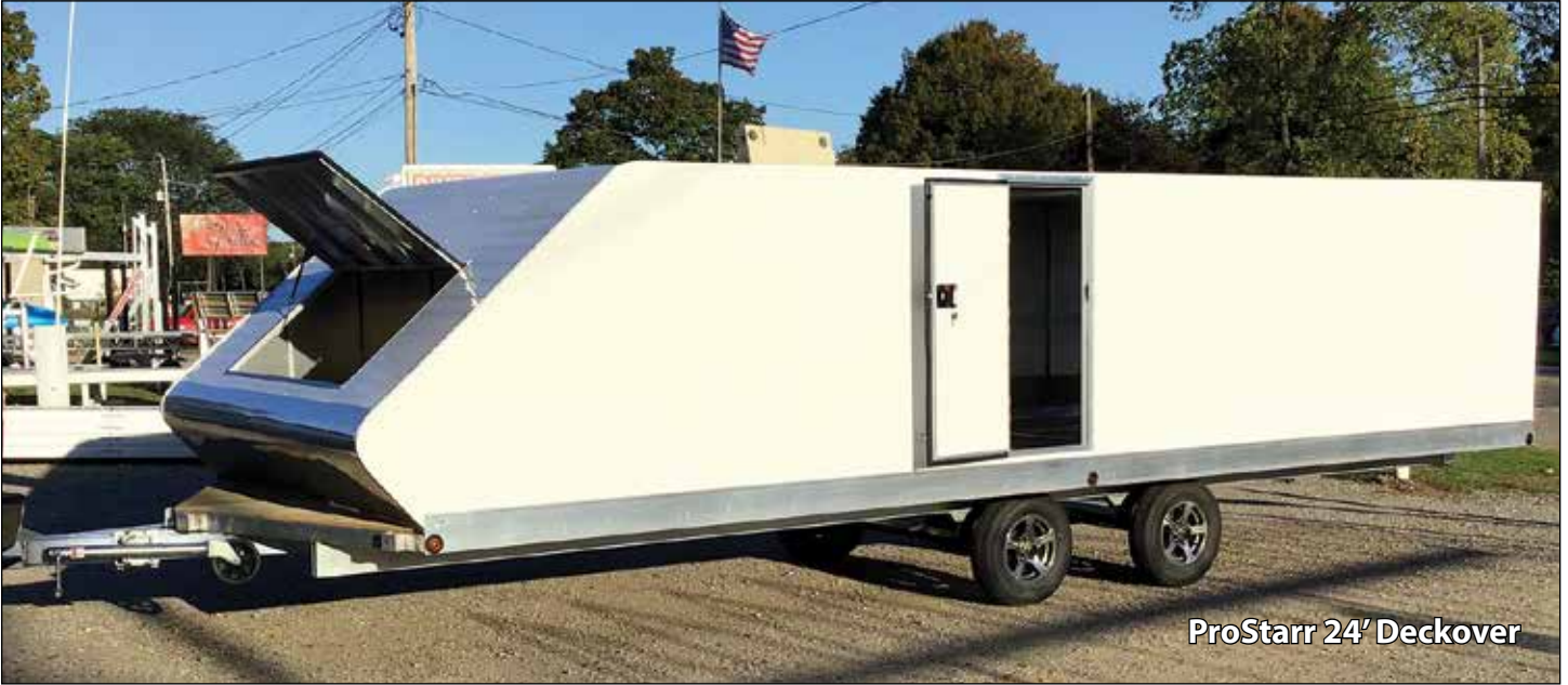
ProStarr 24' Deckover