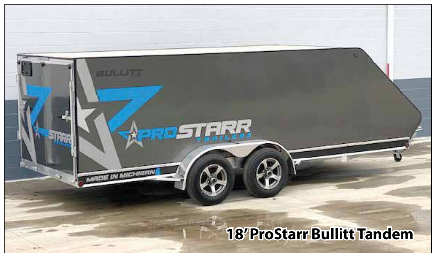
18' ProStarr Bullitt Tandem