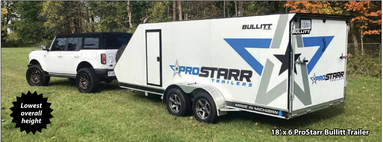
18' x 6 ProStarr Bullitt Trailer

The Bullitt was made for the die-hard snowmobiler that sets out in the middle of a snow storm to their favorite trail. The heavy-duty axle mounts, the large 6-1/2" side rails, and 15" tires make this aerodynamically designed trailer perfect for hauling in the winter months.