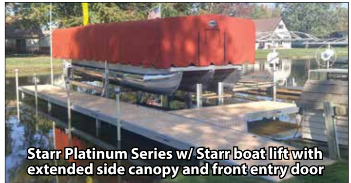
Starr Platinum Series w/ Starr boat lift with extended side canopy and front entry door