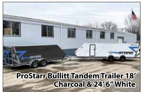
ProStarr Bullitt Tandem Trailer 18' Charcoal & 24'6" White